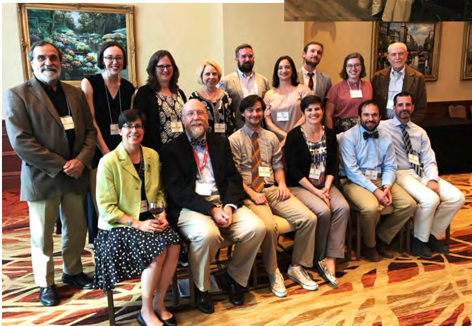
AMNESP at the Vernacular Architecture Forum Annual Meeting in Salt Lake City, Utah.