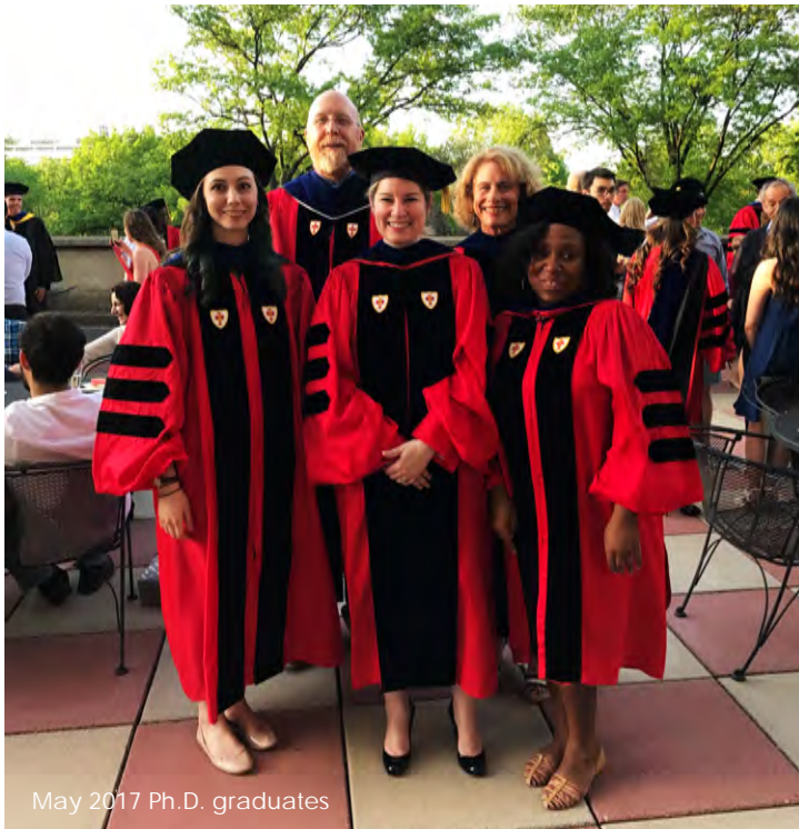
May 2017 Ph.D. graduates