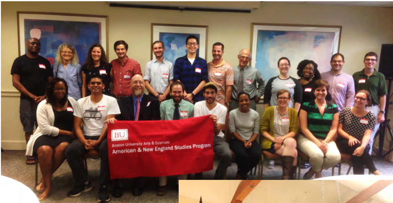
Fall 2016 Welcome Back