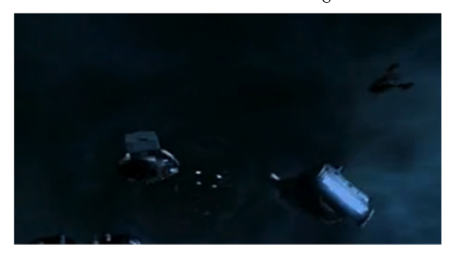
Figure 2: Battlestar Galactica, Season One Opening Sequence

An American road narrative is distinct from road narratives in general because it focuses on aspects of American life particularly, which Battlestar Galactica accomplishes through its allegory surrounding 9/11. Battlestar Galactica 's allegory raises questions about America's 9/11 experience, yet gives few answers; indeed, Battlestar Galactica 's goal is not to provide answers, but to "[invite] people into dialogue" (Primeau 5). For instance, in "(Re)Framing Fear: Equipment for Living in a Post-9/11 World," Brian Ott explores the plotline of New Caprica, a planet that the fleet attempts to settle in lieu of finding Earth. The temporary peace that the fleet has found is interrupted by the Cylons who descend upon the