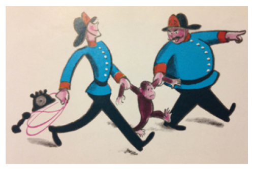
Figure 2: Top of page 39 of Curious George

The cover illustration of Curious George , the first book of the series, has become one of the most recognizable images of the franchise and provides an emblematic representation of the power dynamics, cultural structures, and characterizations associated with racism in America. Adorned in