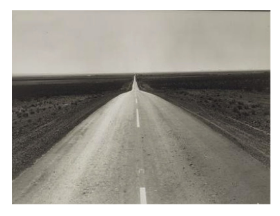
Figure 1: Lange, Dorothea. The Road West. 1938. Silver gelatin. Photograph. Source: www.metmuseum.org

instead replaced by uncharted space in this "futuristic" narrative (Primeau 15).