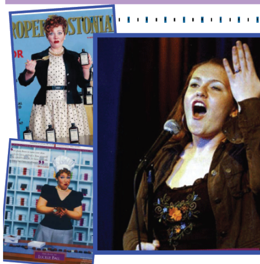
from Comedy Central's Live at Gotham