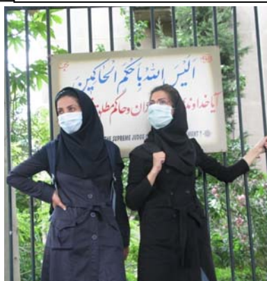
Students in front of Tehran University after the disputed Iranian election