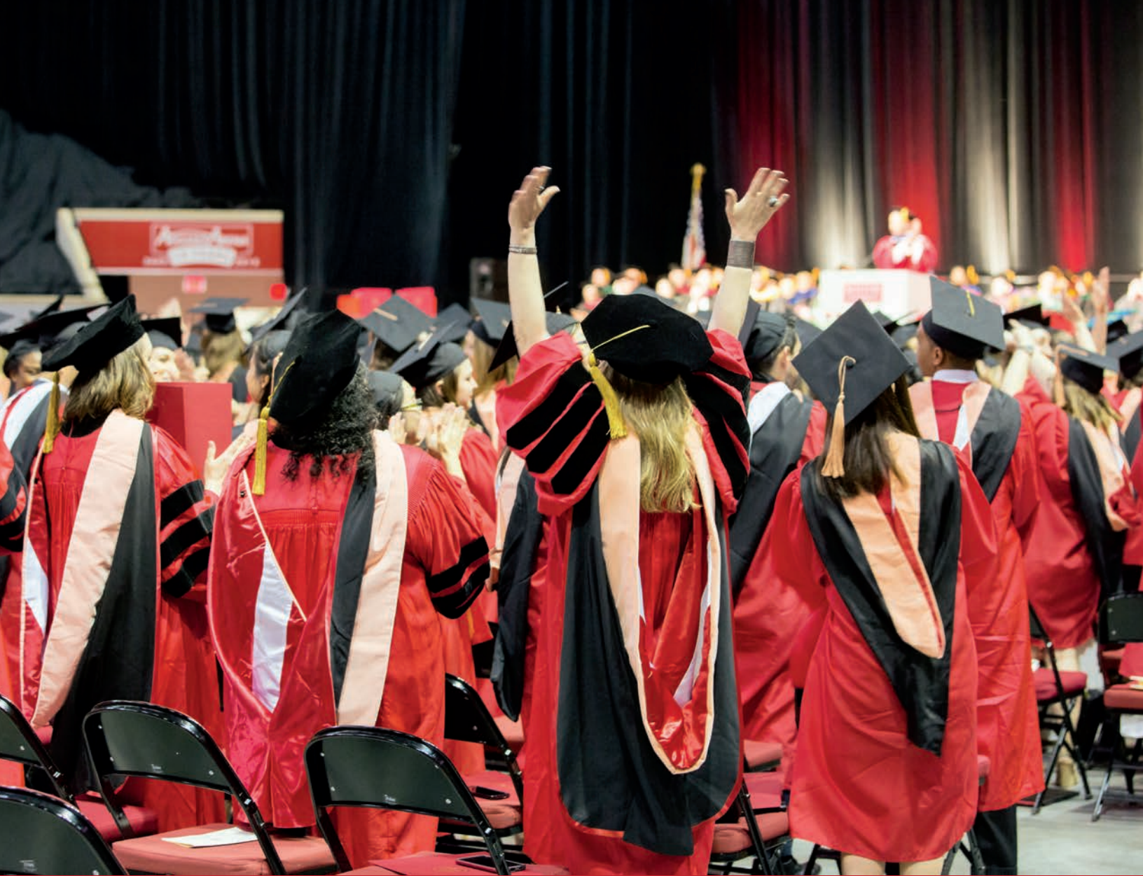
SPH Convocation, Agganis Arena, May 14, 2016

Boston University School of Public Health Development & Alumni Relations