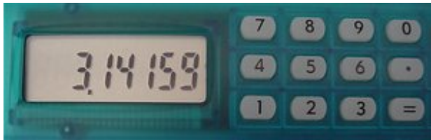
A simple LCD display from a calculator

You probably use items containing an LCD (liquid crystal display) every day. They are all around us -- in laptop computers , digital clocks and watches , microwave ovens , CD players and many other electronic devices. LCDs are common because they offer some real advantages over other display technologies. They are thinner and lighter and draw much less power than cathode ray tubes (CRTs), for example.