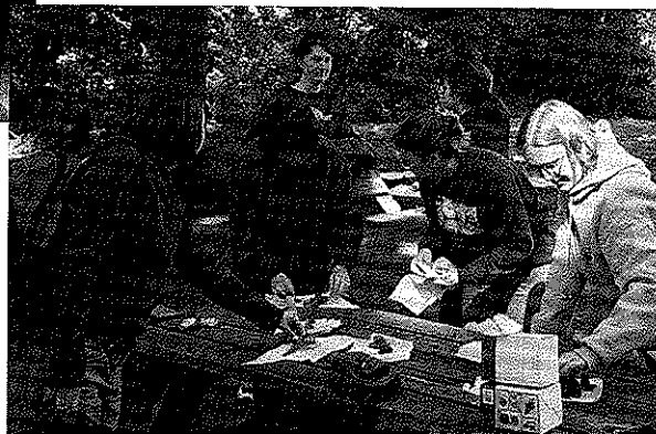
(Below) Retreat participants gather their clay sculptures, souvenirs of the weekend together.

Then we let our creativity flourish, molding clay and talking about our creations, now drying in the sun that finally managed to pierce some of the cold. Some women laughed, some cried, and some sat in silence as we each explained what our new sculpture represented. Not only did we have this time of creativity and enjoyment, but we each had something to take with us, to remind us of what we had experienced in the time we spent together. My sculpture was a statue of a woman—an attempt to represent the woman described in Revelation 12—and she now sits on my bookshelf, the red clay still changing tone as it dries. Along with the prayer bundle I made at the closing worship, she serves as a reminder of my experiences, of the refreshing growth that began when I let myself retreat from the stresses of everyday life, and of the way I was touched by these unfamiliar, new women whom I can now call friends. ♦