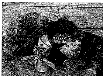
(Above) Women at the retreat made prayer bundles to take home, using the seeds that had served as a symbol of renewal and growth and wrapping them in pieces of the altar fabric.

Women placed their sacred objects on the table in the center of the circle. Magazines, school books, “the Keeper,” statues, and other items were scattered around a bowl of mixed seeds, representing our combined efforts for growth. As we talked about the items on the altar, I found that each woman in the room had a very different idea of what spiritual growth meant to her. Coming from a slightly less diverse background, I was fascinated to see and hear some of the things that these women brought to their spirituality. I saw then that there was a place for me within this group, and by extension, within the Boston University School of Theology community, not because we were all the same, but because we were all willing to lift each other up, regardless