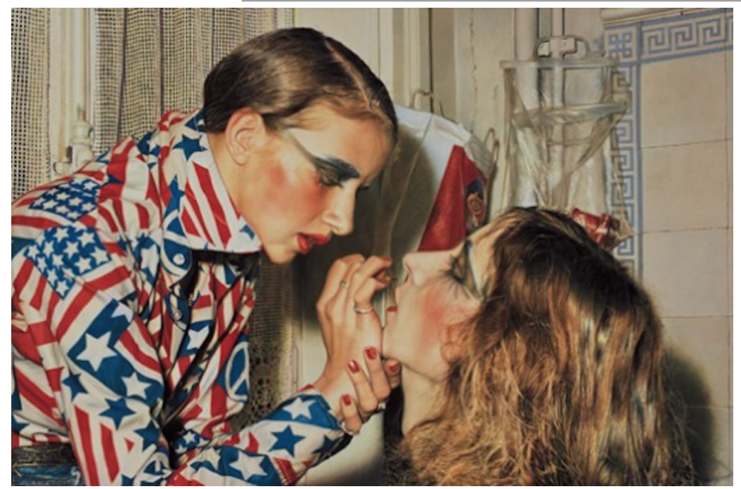
Figure 2. Franz Gertsch, Marina Makes Up Luciano, 1975. Acrylic on unprimed cotton, 234 x 346 cm. Museum Ludwig, Köln.

Photography's ability to trouble the binary between fact and fiction can be deployed as a radical tactic for subverting rigid constructions of gender. Working collaboratively with their respective subjects, Gertsch and Rivera deploy the narrative shorthand of a portrait and the indexical associations of photography to explore the relationship between reality and fantasy. In her book Self/Image , art historian and theorist Amelia Jones writes, "the tension earmarked by aesthetics between subjectivity and objectivity is...at the core of how humans exist in the world." While many artists obscure or avoid this disjuncture, Rivera and Gertsch produce work which is consistent with what Jones categorizes as "retain[ing] rather that attempting to resolve or disavow this tension between the subjective and objective world." Invoking critic Roland Barthes, Jones notes "that representation can only deliver what we think we (want to) know about the other, who is never real but always (somewhere) Real." When it comes to cultural paradigms such as heteronormative gender categories, art can reveal the tenuous relationship between these social constructions: subject, object, and real. Making these constructions visible, Rivera's and Gertsch's works depict people performing a compendium of possible selves embedded in the medium.