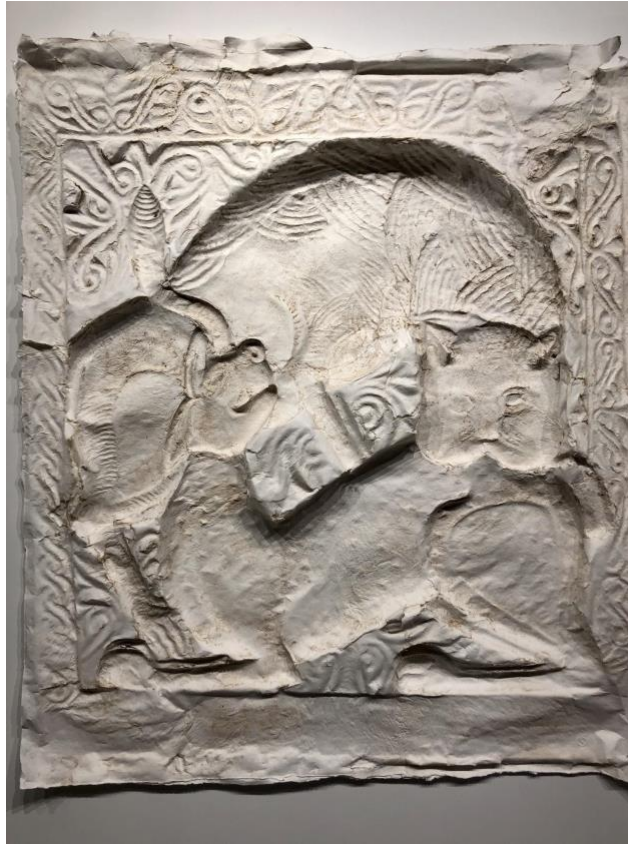
Figure 4. Nora Okka, Squeeze for relief E50, 2015.

In the center of the room, visitors can look at archival material from both the ASCSA's own archives and from the Benaki Museum, which shows images of the church from the 19th century onward, ranging from architectural plans and photographs to an 1890 watercolor by artist Mary Hogarth (Fig. 5). These images serve to both place the visitor within the context of the church and as a tool to place the reliefs, seen in negative on the gallery walls, on their Byzantine building. More than that, the archival material functions as a lens, illuminating how this building has been seen over time. Often these images have the same perspective on the Little Metropolis—a slightly askew picture of the front of the building, surrounded by either people or plants or construction. Sometimes, they show independent spolia, prompting an eagle-eyed visitor to find its imprinted counterpart in the exhibition. Consistently, however, they are able to demonstrate both the persistent, if sometimes repetitive, nature of interest in the church and the durability of the Little Metropolis, as a living monument in the center of Athens.