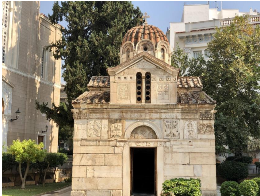
Figure 2. View of the entrance of the Little Metropolis Church, 12-15th century, Athens, Greece.