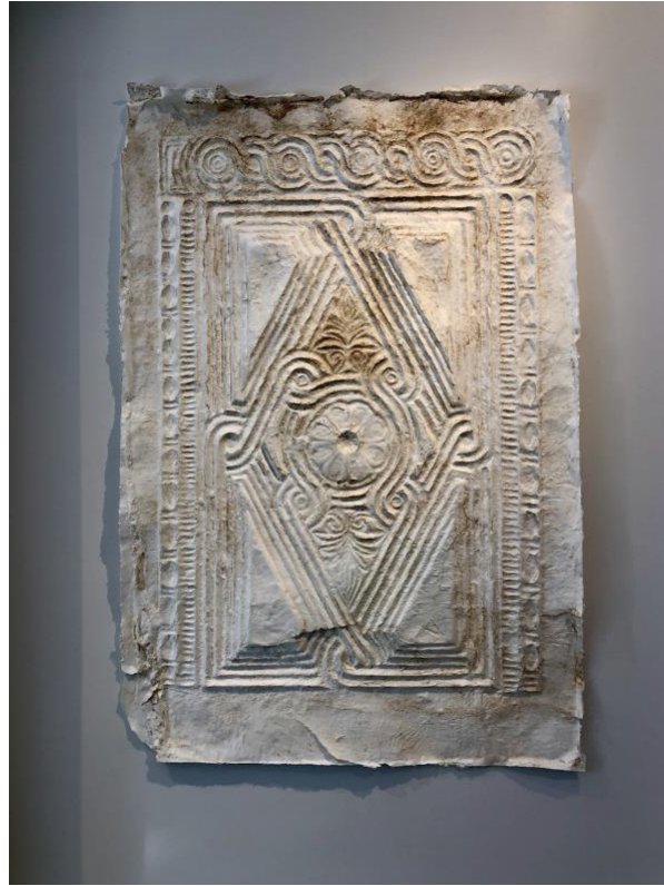
Figure 3. Nora Okka, Squeeze for relief E71, 2015.

At first glance, the exhibition strikes the visitor as a repetition of white: each squeeze appearing plaster-like in its white mount and wooden frame, reflected upon the marble floor of the I. Makryiannis Wing. The surprise comes when you look closely at each individual squeeze. Each has its own texture, covered in relief both high and low, and allows the visitor to think about the reliefs on their own merit, divorced from the architectural program of the church for the first time since the Little Metropolis was built (Fig. 4). Being able to process the reliefs as distinct objects is a transformative experience, allowing one to think about the life of the spolia prior to its inclusion in the church: as part of a funerary stele, temple, or doorway. Simultaneously, the viewer also is faced with the competing idea of the squeeze as an original work of art. It copies the relief, but does not exactly reproduce it, as it shows the work in negative.