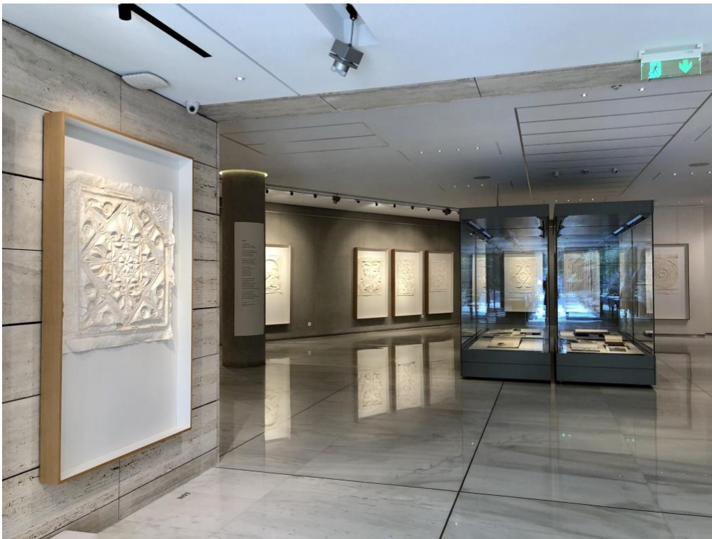
Figure 1. Installation view of “Spolia: Transcripts of the Stones of the Little Metropolis,” 16 October 2019, Gennadius Library, Athens, Greece.

Housed in the Gennadius Library of the American School of Classical Studies at Athens, Nora Okka’s “Spolia: Transcripts of the Stones of the Little Metropolis” (Fig. 1) brings new life to the relief sculpture on the church colloquially known as the Little Metropolis, so named because of its towering neighbor, the Metropolis Church.