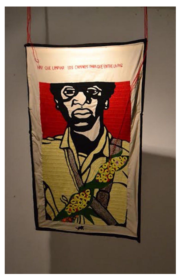
Figure 2. Zapatista women's embroidery collective interpretation of Emory Douglas illustration, 2012. Embroidery.