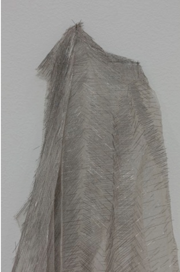
Installation view of Disremembered IV (detail) in Doris Salcedo: The Materiality of Mourning , on display November 4, 2016-April 9, 2017 at the Harvard Art Museums. © Doris Salcedo.