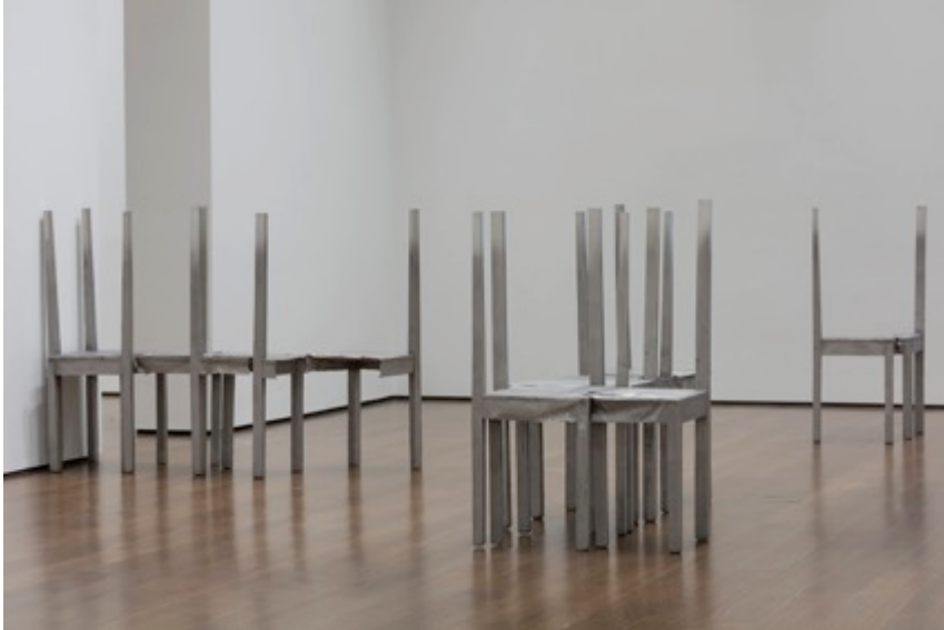
Installation view of Thou-less and untitled chair works in Doris Salcedo: The Materiality of Mourning , on display November 4, 2016-April 9, 2017 at the Harvard Art Museums. © Doris Salcedo.