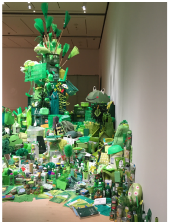
Han Seok Hyun, Super-Natural , 2011/2016, mass-produced products.

of Western and Nonwestern art history, but instead may have created a sense of confusion for visitors wondering why they were seeing works of contemporary art in historical galleries. Despite this missed connection, the overall exhibition presented an engaging experience that not only offered insight into the state of contemporary art in Asia, but also the way that Asian artists have chosen to render and make sense of the dynamic cities they call home.