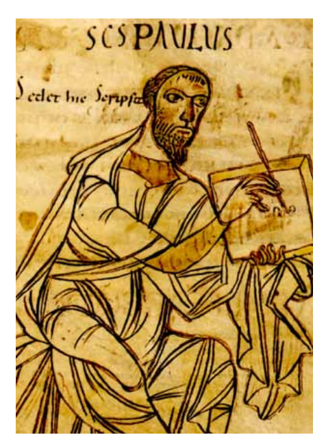
An early European depiction of St. Paul.

But who is the book for? Christians (at least in principle) already read the New Testament. One of the editors' specific goals is to demystify these texts and get Jews to read them without worrying about the historically uncomfortable issue of conversion. The religious orientation of all of the contributors, the editors hope, should quiet this fear, while promoting cultural understanding. Increasing understanding of a foundational text of majority culture is a laudable goal for our vigorously mongrel democracy. Perhaps