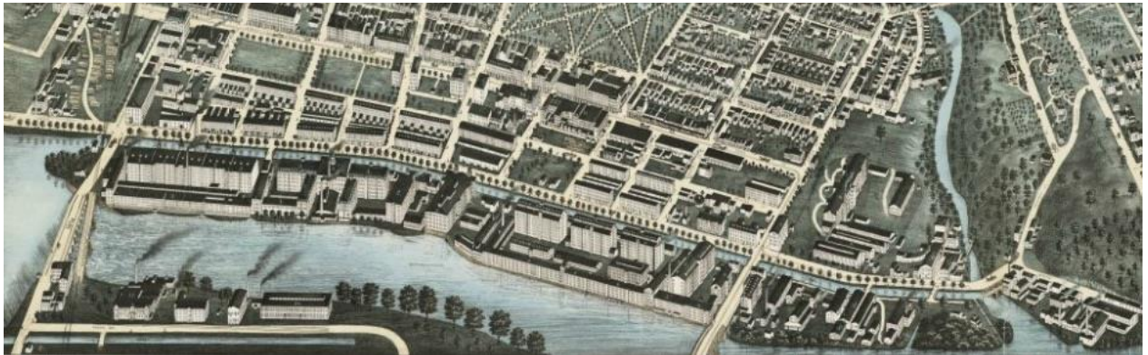
[Merrimack River at Lawrence, Map of Lawrence, ]