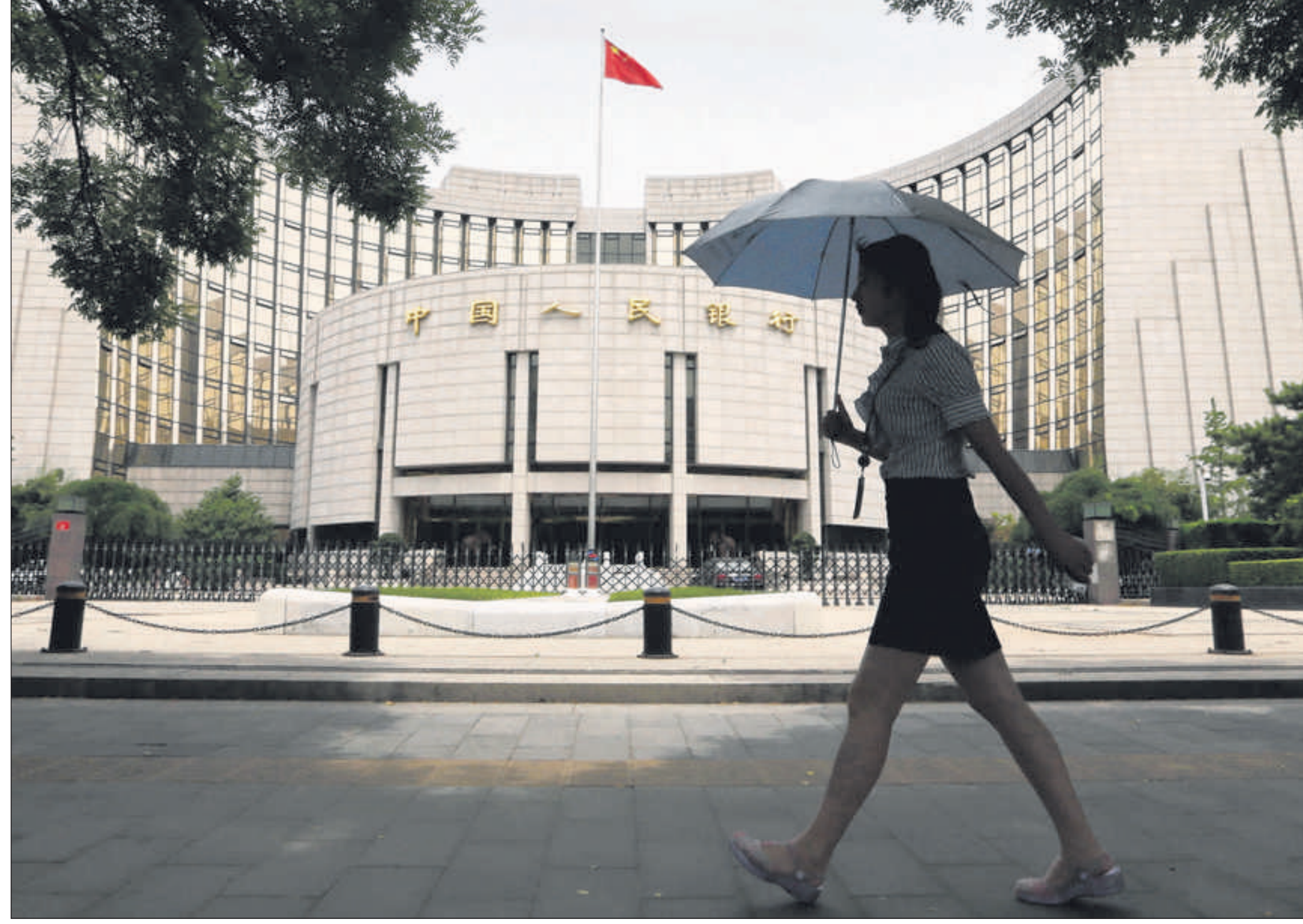
Taking a risk? If China does not now proceed with great caution, few countries will weather a financial crisis when it hits China. All around the globe, we are reliant on China for trade, investment and finance. Simply put, China is too big too fail.

However, at this point China's investment rates are too high and Chi-