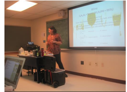
Lectures from experts in the field