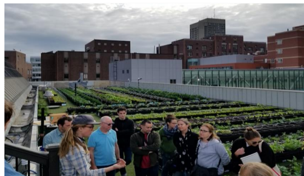
Field trips and field work