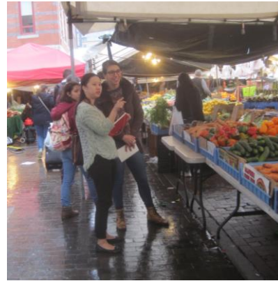
Food observations at Haymarket and Boston Public Market