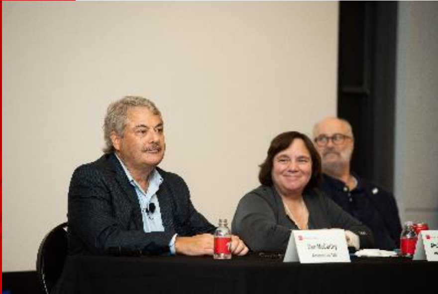
Career paths with an SCM degree