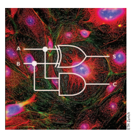
Systems biology applications include everything from total genome rewrites to simple pathway engineering.

promoter really be off, for instance, but genetic circuits are often leaky, producing transcripts even in the absence of an activating signal. "Biology is still very far removed from being an engineering discipline," Collins says. Still, he and others in the synthetic biology com-