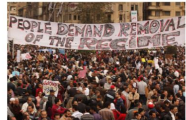
Learn about the Arab Spring and other revolutionary events and ideas