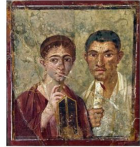
Explore the art and culture of the ancient world