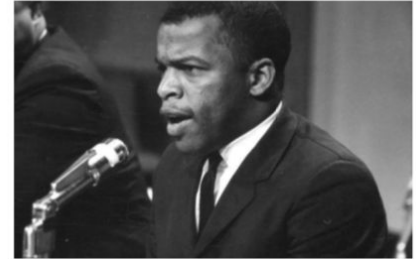
Examine speeches by Rep. John Lewis, Civil Rights leader and U.S. politician.