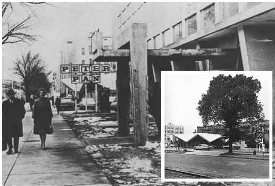
The Peter Pan restaurant, now replaced by the Center for Computing & Data Sciences.

On June 15th the BUSRFS had a tour, organized by LHF, of the newest BU building, the Center for Computing and Data Sciences. The block of Commonwealth Ave. and Granby Street has a history of being home to unusual architecture. This corner was home to a fan shaped building, the Peter Pan restaurant, which occupied that space into the early 70s. It was replaced by a Burger King, parking lots, and a Middle Eastern food trolley.