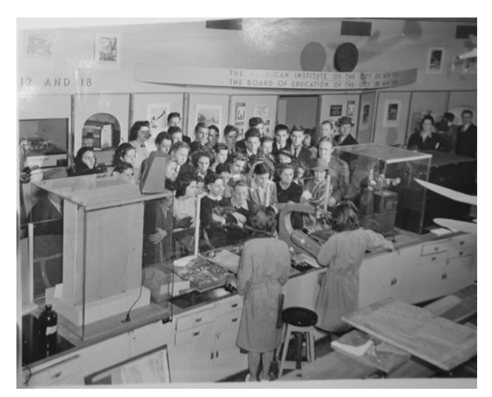
Figure 1. A crowd gathers to watch students performing chemical experiments in the Junior Science Hall of the Westinghouse building at the New York World's Fair. AIR, Box 420, Folder 1. Collection of the New-York Historical Society.

in New York conducted chemical experiments in the manufacturing of cosmetic products. Figure 1 portrays two of these students working behind a glass barrier in front of a crowd of onlookers. Nearly 6.5 million people visited the Westinghouse building in the World's Fair's first year.<sup>39</sup>