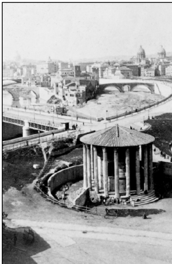
View of Rome's skyline near the Tiber River, ca. 1900.

I also believe—and this seems obvious from modern experience—that sophistication in intellectual life generally requires solid economic underpinning. In my book I attempt to show this by focusing on the evidence of graf-