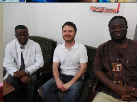
CEESP Students and Mentors