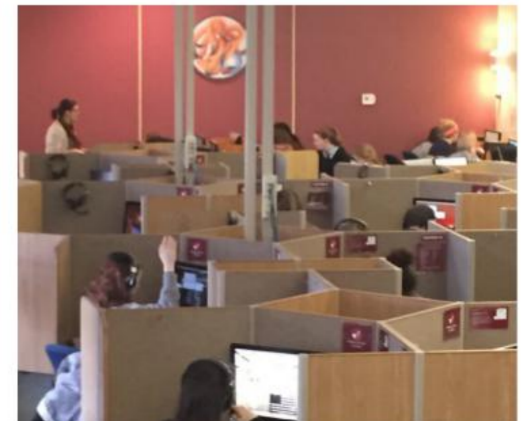
Multi-use Computer Lab