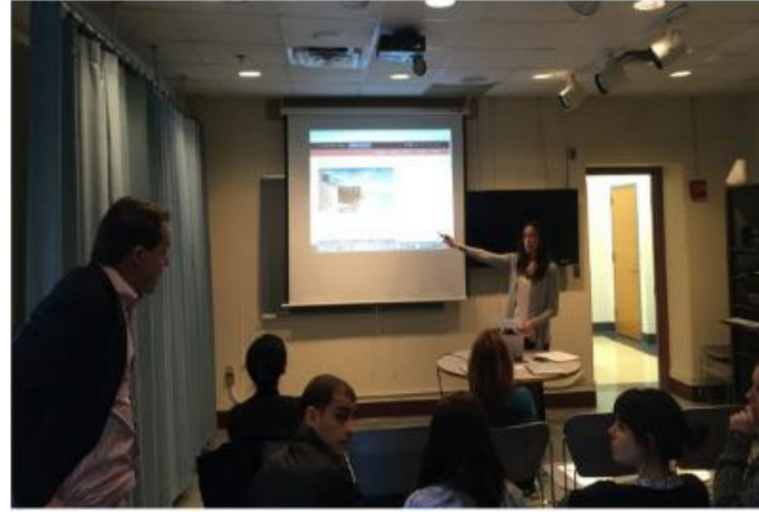
Spring Faculty Showcase