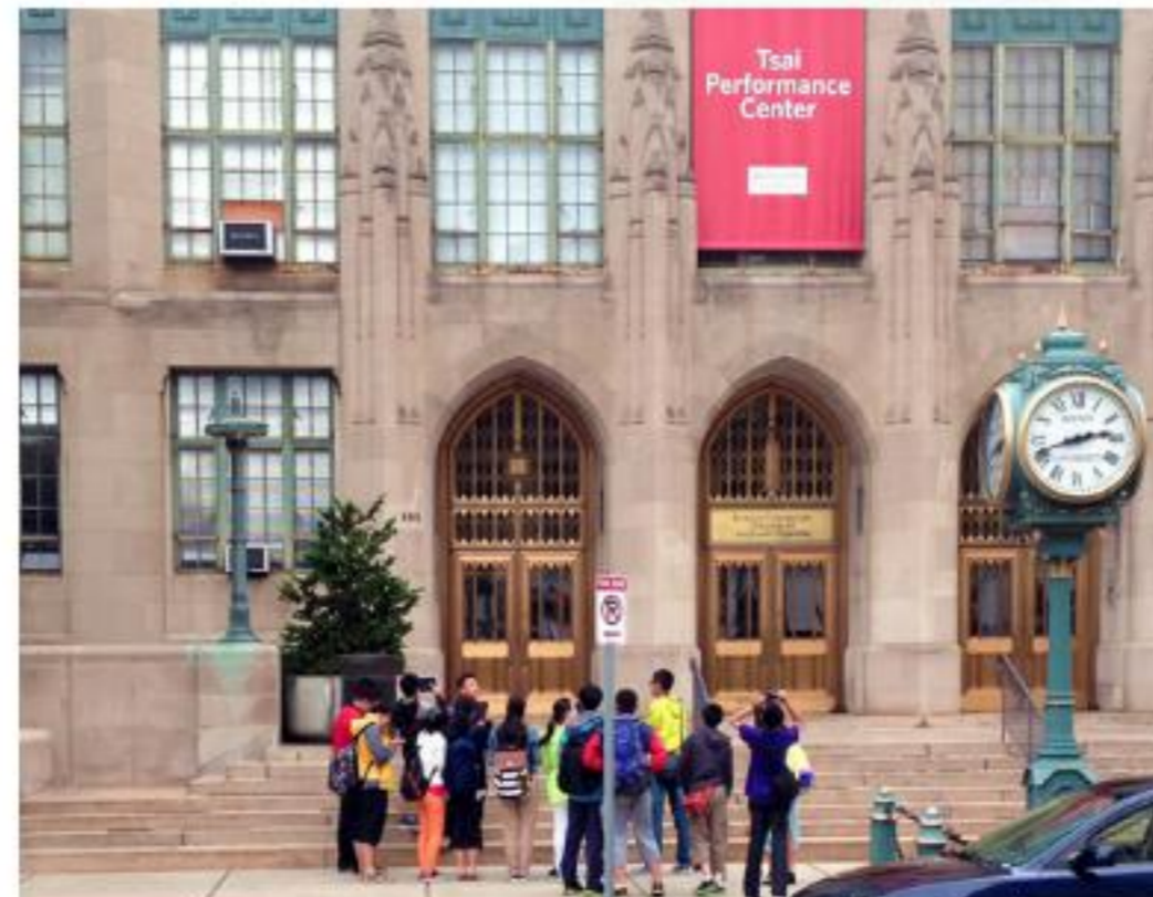
ITF Orientation Group - Comm Ave