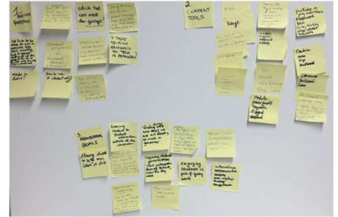
Idea Generating - Teaching with Technology Workshop