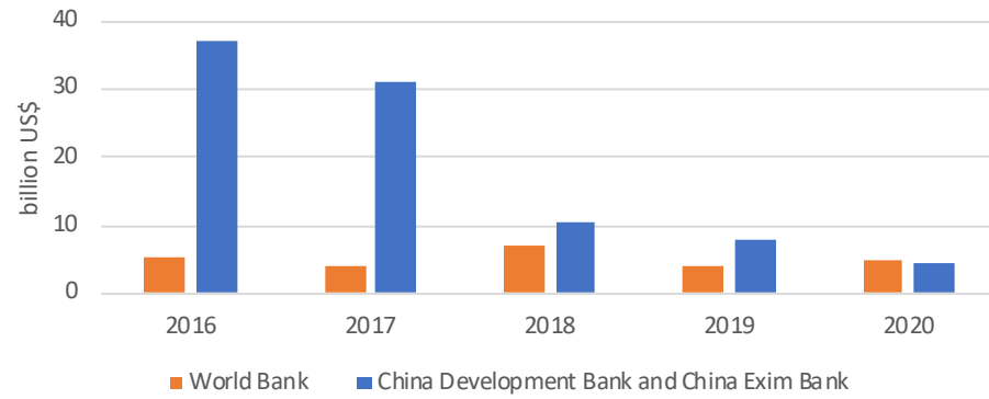
Figure 2: International Energy Finance from the World Bank and Chinese Development Banks, 2016-2020

Source: World Bank project data; China's Global Energy Finance database, 2021. Boston University Global Development Policy Center.