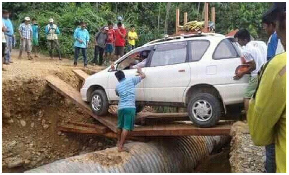
Image 4: Rapid destruction of the embankment during rainy season, December 2017