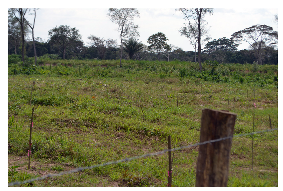
Image 7: Area razed by the company, which is currently being reforested