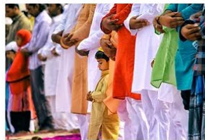
Religious & Supernatural Beliefs

An international, cross-cultural, collaborative research network exploring the development and diversity of cognition