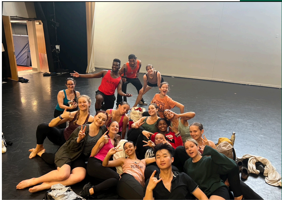
Introducing the 2022 Reach ensemble!

One of the challenges we faced this year was a shortage of teen apprentices auditioning for the program. We originally accepted 10 when we'd planned for 15. We can speculate this was due to a post-COVID reality: we'd lost continuity, our connections with high school teachers and guidance counselors were disrupted, families had planned long overdue vacations, and more teens were seeking work opportunities. We made two adjustments: 1) we split the five-week program into a one-week Pedagogy Intensive and a four-week Reach program; 2) We accepted more college interns. The results were impressive!