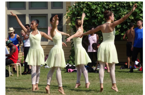
Lovely ballet quartet performing at a Boston community center

Your gift will help us reach our goal and keep this program alive!