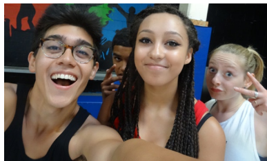
Working together. Building friendships.

100% of your donation benefits the Reach program and is fully tax deductible.