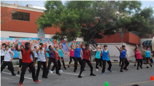
Our multi-ethnic, multi-generational Reach company in performance at the annual free public concert in Cambridge