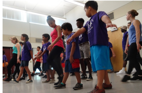
Engaged campers during a Motion Art workshop

Reach impacts our teen apprentices, by teaching life skills such as collaboration, communication and discipline;