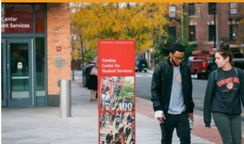
FIGURE OUT THE FINANCING USE OUR EASY LOAN CALCULATORS