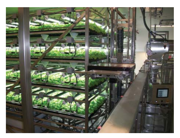
First-of-a-kind, plant-based vaccine factory

In collaboration with Boston University, Fraunhofer CMI conducts advanced research and development leading to engineering solutions for a broad range of industries, including biotech/biomedical, photonics, and renewable energy. Engineers, faculty, and students at the Center scale up basic research into advanced technologies that meet the needs of both domestic and global client companies. The primary focus is on the development of next-generation high-precision automation systems, instruments and medical devices.