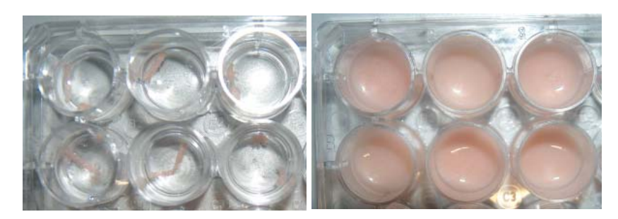
10 mg hotdog samples in 100 microliters of water, before and after 60 seconds of homogenization.