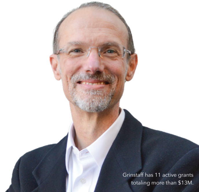
Grinstaff has 11 active grants totaling more than $13M.

MERCK PARTNERSHIP: Muhammad Zaman (BME, MSE) secured a strategic partnership with Merck Global Health and is preparing to deploy PharamaChk , a user-friendly tool that tests medicines for contamination. The team aims to make the device globally accessible - particularly in areas at high risk for pill contamination.