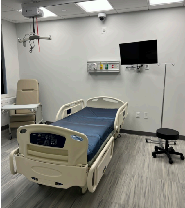
Boston University Sargent College of Health & Rehabilitation Sciences