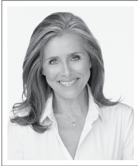
The Meredith Vieira Show