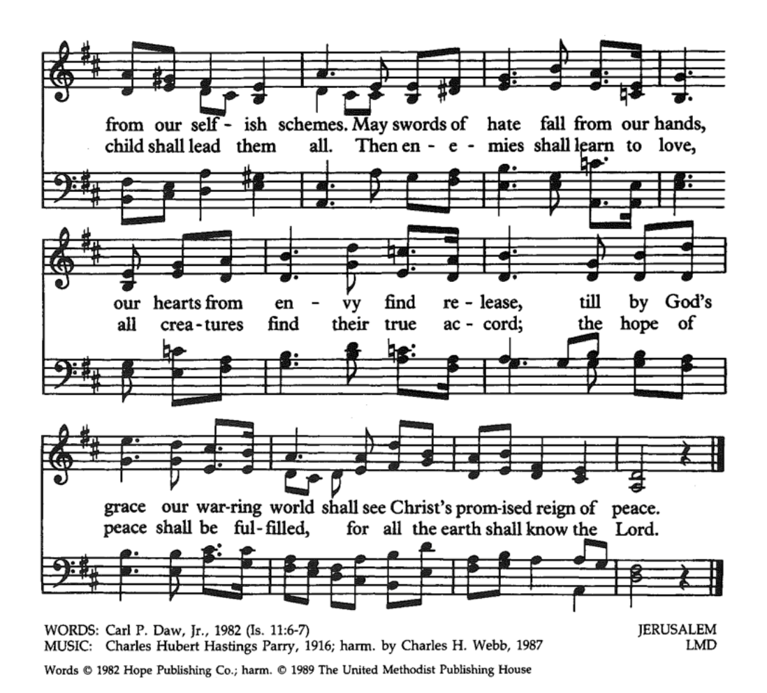
Call to Prayer (sung by all)