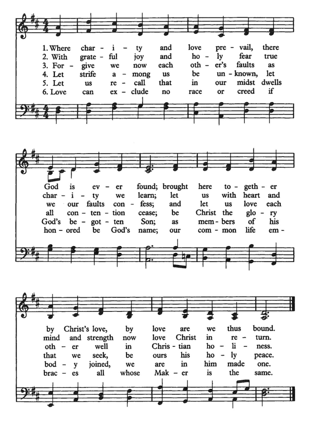
WORDS: 9th cent. Latin; trans. by Omer Westendorf, 1961 (1 Jn. 4:16)ST. PETERMUSIC: Alexander R. Reinagle, 1836; harm. from Hymns Ancient and Modern, 1861CM

Trans. © 1961 World Library Publications, Inc.