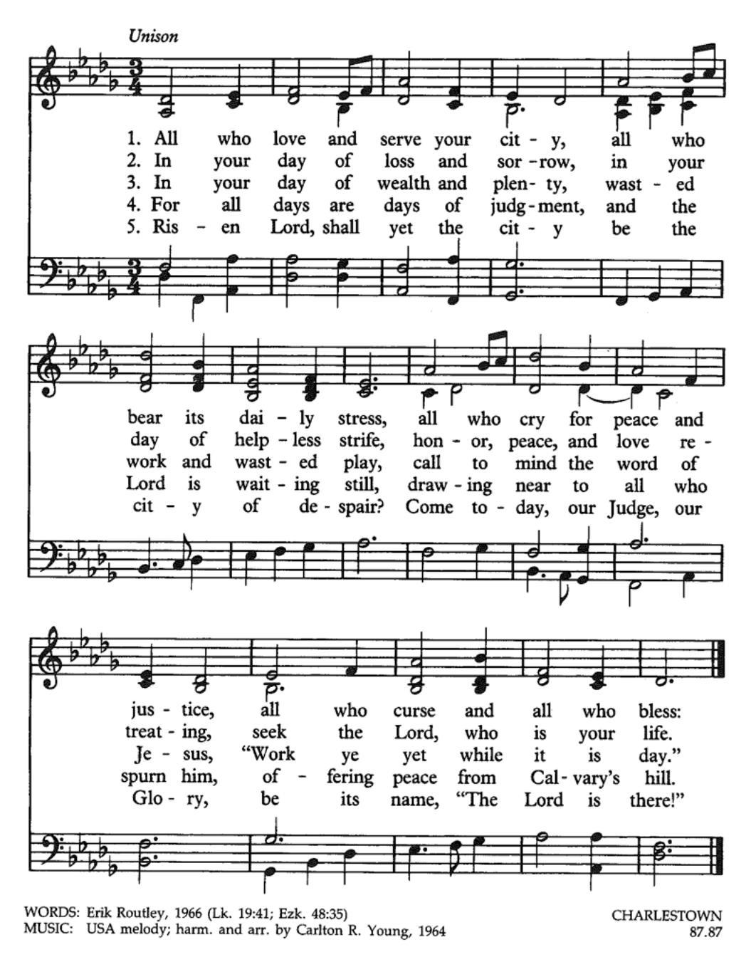
Words © 1969 by Galliard, Ltd.; harm. and arr. © 1965 Abingdon Press