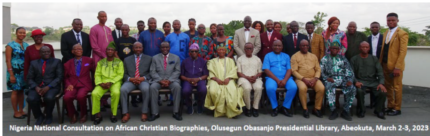
Nigeria National Consultation on African Christian Biographies, Olusegun Obasanjo Presidential Library, Abeokuta, March 2-3, 2023