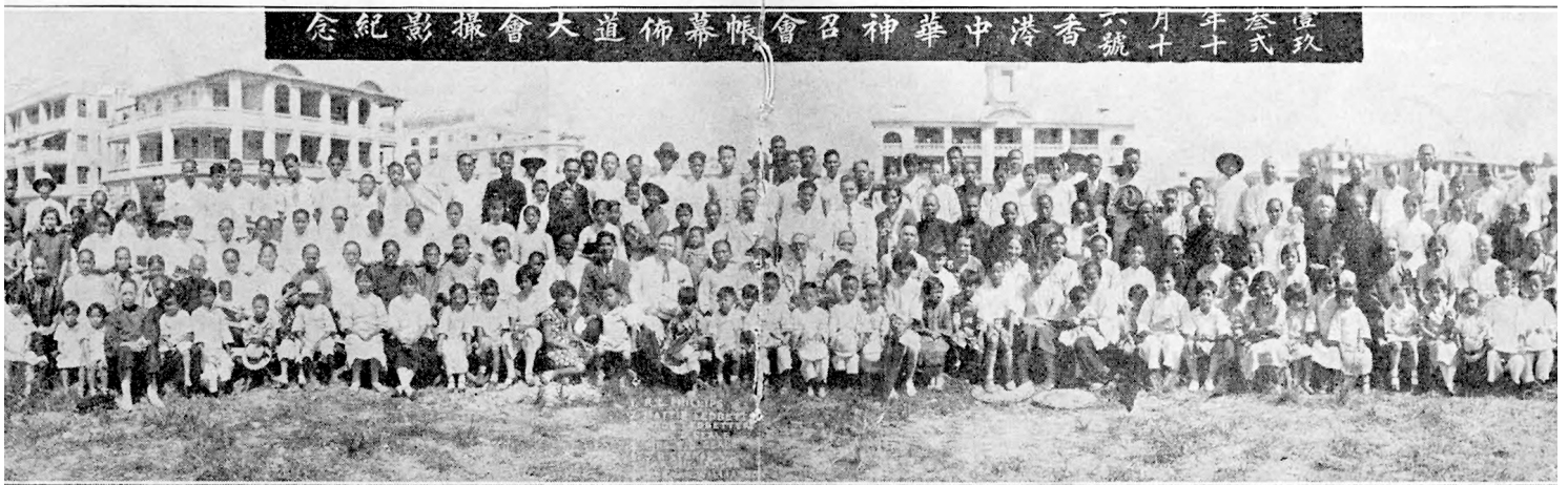
Some of the people who attended the tent meetings of our South China District Council in Hongkong, South China