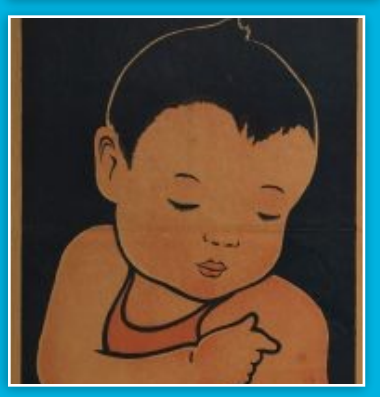
Top: "The Life Saver," Yale Divinity School, RG221

Middle: "Oranges from our Heavenly Father," SOAS University of London, PP MS 16/07/04/09