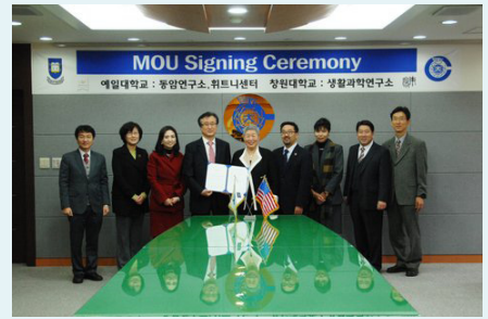
Signing MOU with Changwon, ERI and the Whitney Center at Changwon National University. 11.28.2012