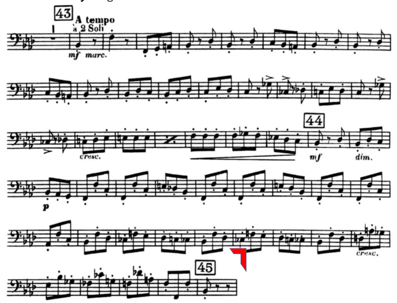
Maslanka: Symphony No. 7, first movement, measures 99-106