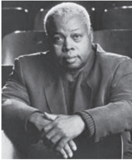
ED BULLINS 1935-2021