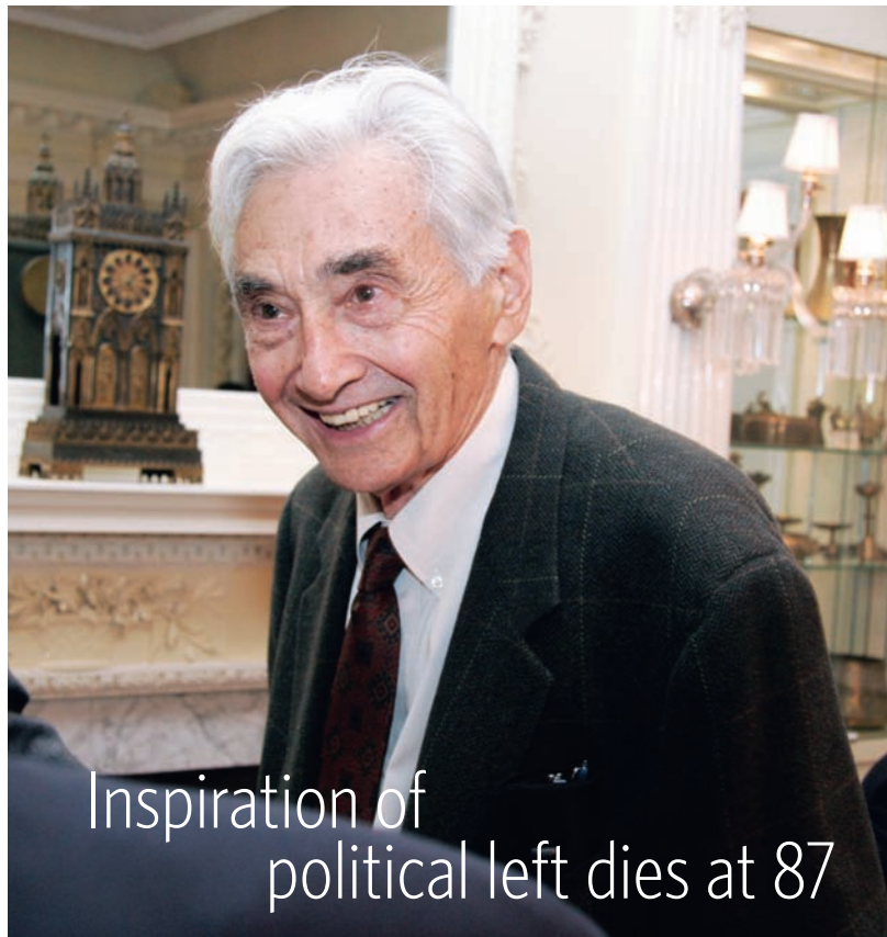
← HOWARD ZINN taught in front of crowded lecture halls and clashed with the administration during his twenty-four years at BU.