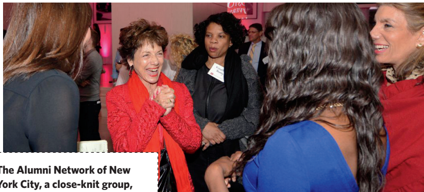
The Alumni Network of New York City, a close-knit group, enables members to meet new people with similar interests.