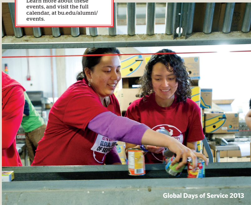
Global Days of Service 2013

→ This is a selection of events from the full alumni calendar. Learn more about these events, and visit the full calendar, at bu.edu/alumni/events .