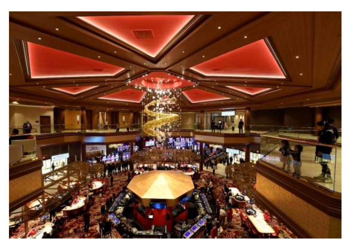
The Lucky Dragon Hotel & Casino in Las Vegas, Nevada includes a nine-story hotel with 203 rooms, 27,500 square feet of casino space and five Asian-inspired restaurants. The fire element is heavily represented through its bright red, yellow, and orange design elements.

The style, color tone, and name of the hotel are all considered part of the feng shui design elements. They are also part of the hotel's cultural connotation, business ideas, and feng shui pattern summary and expression. The style and name of the hotel guide to the consumer culture, while the color tone can illustrate the interactive relationships among the five elements of feng shui. Of course, these and many other elements show the convergence of the five elements of feng shui. Basically, in a way, all design elements incorporated into the hotel have some relationship with feng shui.