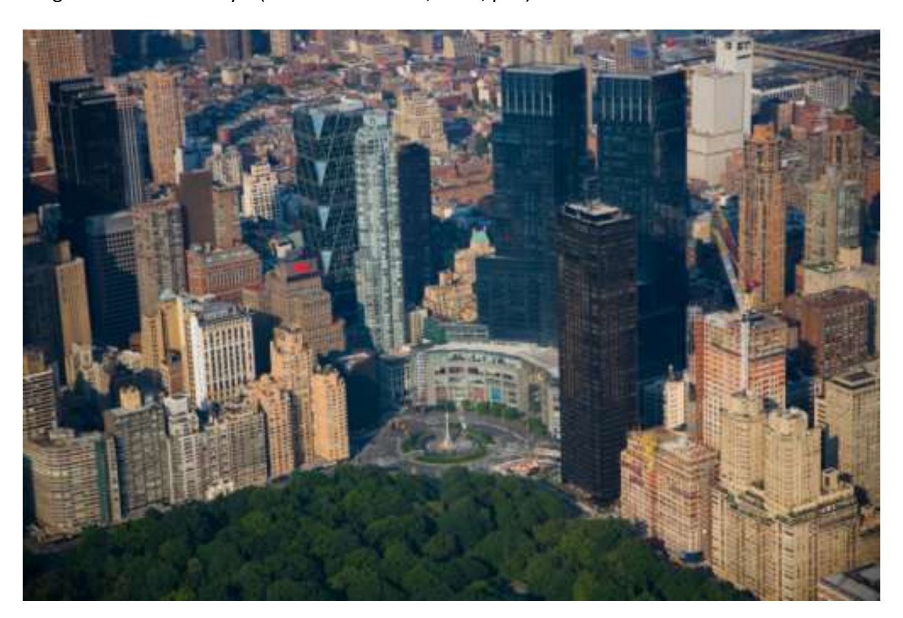
The main entrance of Trump International Hotel and Tower (right of Columbus Circle) faces Central Park rather than Columbus Circle.

Finally, the Lucky Dragon Hotel and Casino, a 203-room boutique resort off the northern end of the Las Vegas Strip, was the first Asian-themed resort in Las Vegas that heavily implemented feng shui into the overall casino design to prevent and limit any negative superstitious beliefs (Pierson, 2016). For example, "the rose-colored resort's front entrance is designed in a dragon motif. A feng shui master blessed its kitchens. The main bar is eight-sided for good fortune"