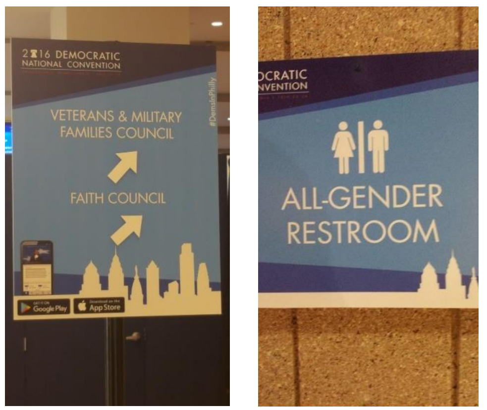
DNCC signage at Wells Fargo Arena, July 2016. Photo reprinted with permission.

Unfortunately, if something goes terribly wrong during a spotlight event, the city itself can be remembered with lasting negative images. As previously mentioned, Philadelphia was still remembered for the large number of protester arrest during the 2000 RNC. Chicago is still reminded of the images of the riot-plagued 1968 DNC convention, let alone Miami for the 1972 DNC in terms of a sheer fiasco, or even the 1868 DNC held in New York City whose slogan was "This is a white man's country, Let a white man rule". The Convention has come a long way since these times as this change has been recorded and duly noted.