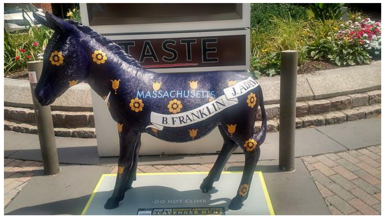
Massachusetts donkey located outside of the Sheraton Society Hill Hotel, July 2016

Initiative #1. The "Donkey's Around Town" was an installation of 57 fiberglass donkeys, each painted by a local artist, to represent a participating Convention delegation. They were placed in publicly accessible locations across the city and were also used to create a warm reception for delegates at their respective host hotels.