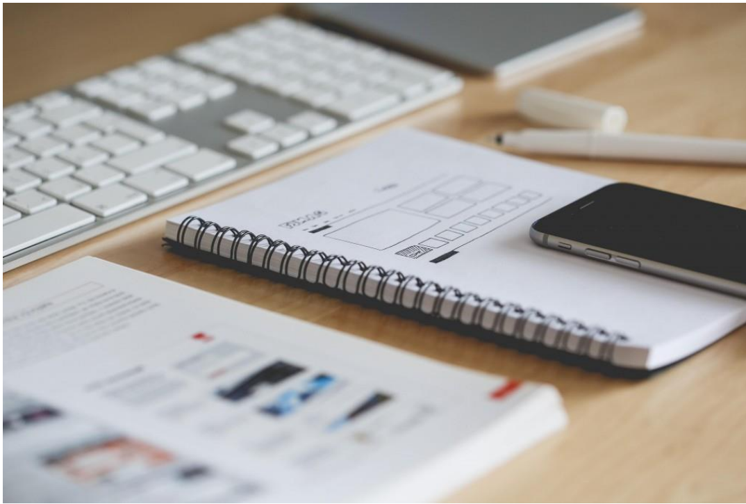
1 Responsive websites ensure a design adapts to desktop and mobile users automatically, enhancing the customer experience.