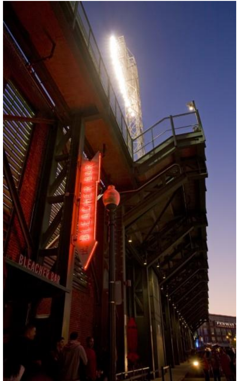
4 From Lansdowne Street, the glowing Bleacher Bar sign invites fans and tourists in for a unique experience

One of the most interesting parts of the design is the opening onto the field itself. Originally, there was a metal panel door in the opening, painted green to blend into the padding along the outfield wall. The park later replaced it with a glass overhead door that provided an excellent, if limited, view of the field. The challenge was, how to allow the bar patrons see onto the field without being seen by the players? The overhead door in question was directly in line with the batter's field of vision as they watched the ball release from the pitcher's hand. How could we prevent a flashing light or movement inside the bar from distracting the batter? Especially a Red Sox batter! I found a one-way film produced locally that had the potential to allow one-way viewing through the glass. The film was expensive and had to be printed with official Fenway green paint color. We arranged for a mock up and test after the completion of a night game. We worked with the contractor to set up lights and people standing in the opening with the door closed – just as it would be during a game. We were able to walk from the opening around the warning track and stand behind home plate to see if the product would work. As we walked on holy ground I asked the owner's representative who was going to approve the installation before the developer spent money on the expensive film? The