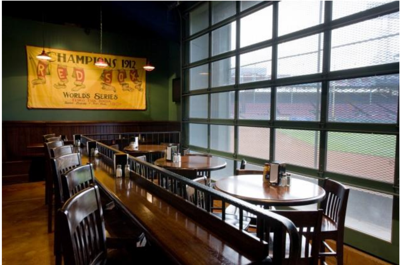
5 A one-way film created to match the iconic Green Monster wall discreetly hides patrons from distracting the baseball players while still allowing for a clear view of the field from inside the Bleacher Bar.

answer was “No one. If any player complains to the players association, a metal panel door will have to replace the glass door.” If that happened, that would be the end of our key attraction in the restaurant/bar. It was a gamble that fortunately paid off.