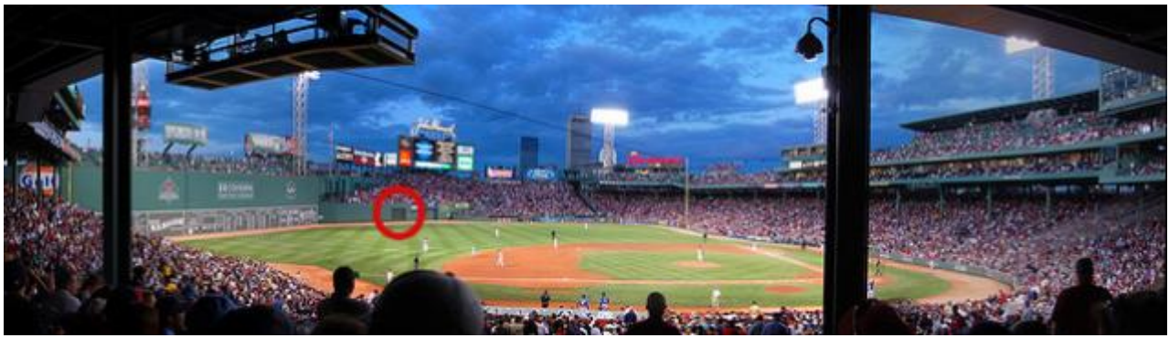
2 The Bleacher Bar sits unobtrusively below the famous Green Monster outfield wall, free of distracting the players and batter.