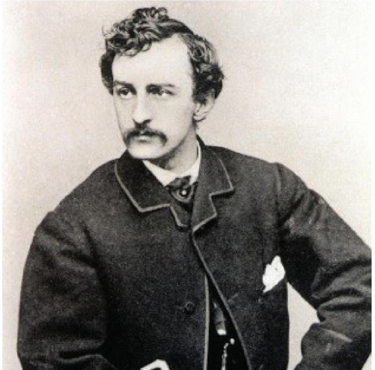
Right, John Wilkes Booth