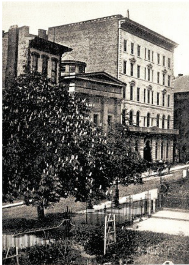
Left, The Omni Parker House located on Park St., Boston