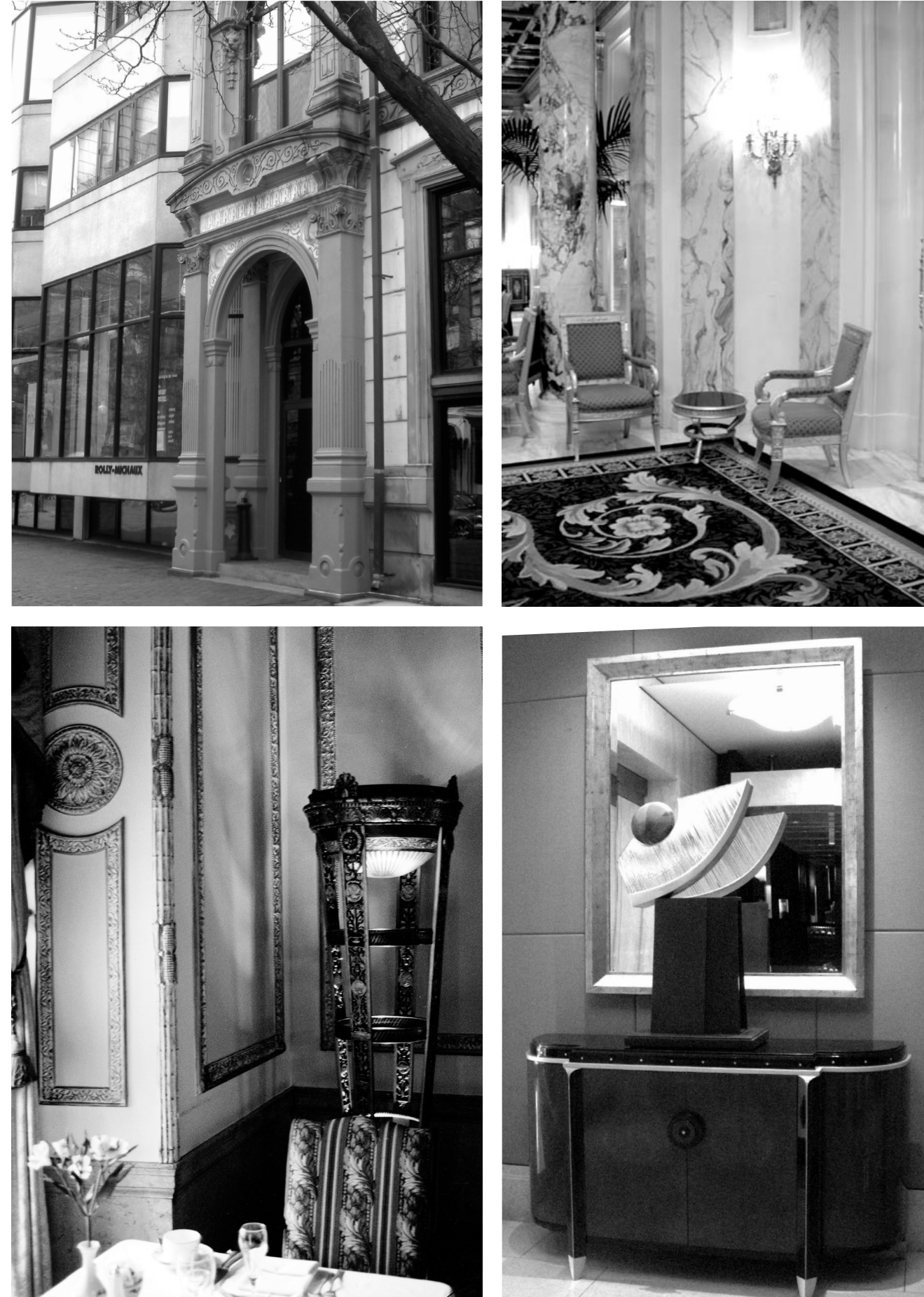
Right Fairmont Copley Plaza Hotel

Left Vendome Condominium, formerly the Vendome Hotel